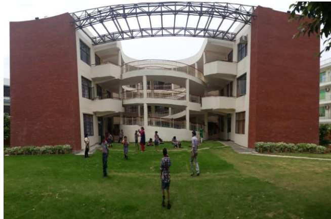
Khushboo Welfare Society